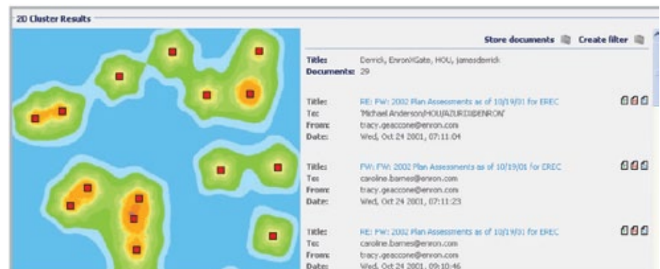
Figure 1: ControlPoint reporting dashboard with 2D cluster map showing hot zones.

As a centralized information governance console for all connected data sources, ControlPoint simplifies the definition and application of policy regardless of data format or location. There is no need for source-specific policies, which become difficult to manage and unify across the enterprise, and you eliminate the need for staff to learn multiple system tools and user interfaces. ControlPoint's role-based security allows the delegation of different tasks to reduce the likelihood of errors and bottlenecks.