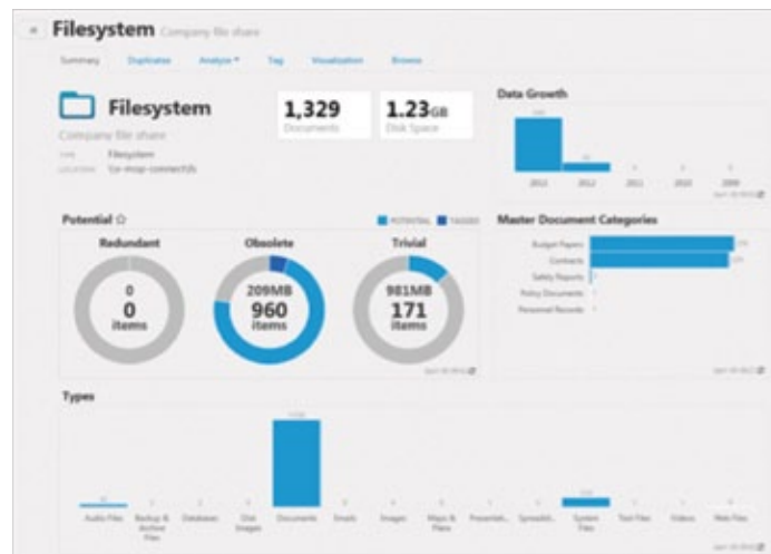
Figure 4: ControlPoint dashboard showing the ratio of redundant, obsolete and trivial data.

Trivial data is determined by file type, where the file type has no content value, such as executables, system files, and thumbnails.